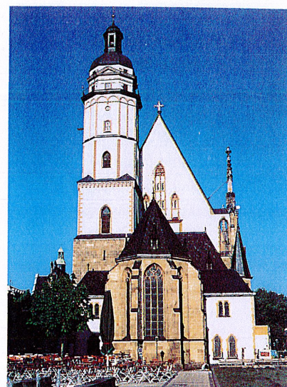
RIGHT: Thomaskirche in Leipzig, where Bach was an organist and choir-master, and where he was subsequently interred.

School in Lüneburg, 320km (200 miles) away in north Germany. There he benefited from a solid musical education and sang in the choir, but his formal education came to an end in 1702.